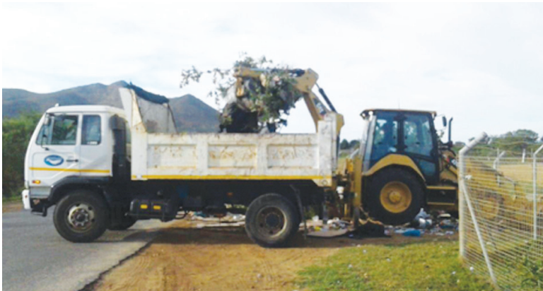
What a waste! Illegal dumping unnecessary burden on capacity and serious threat to public health.

Help us stop this unsightly costly scourge